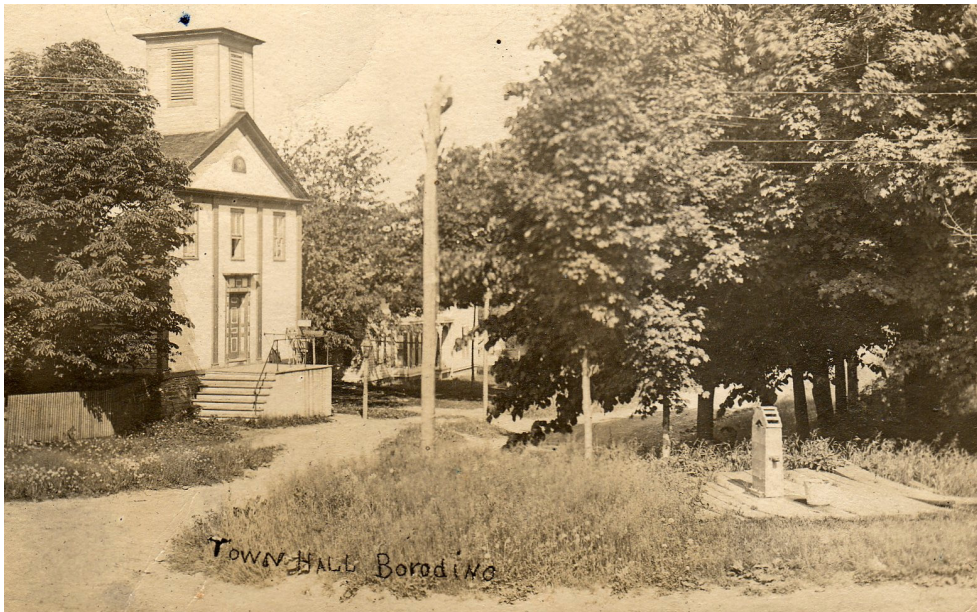
A Picture Post Card of Borodino Town Hall mailed on November 9, 1911

I wrote the first "Borodino (Grange) Hall Time Line" for our June 2004 Newsletter. As part of my on-going research, I have found additional historical events held at the hall, plus we have made contributions to its recent history. I'm sure (hopeful) as I continue my research that I will discover more interesting events which will continue to illustrate what an important role the hall has played in our town's history. I stated in the first time-line the early years are somewhat of a mystery. Documentation has lead us to believe the structure was built c. 1833. Our historic building is approximately 164 years old. Here is what I have compiled, so far: