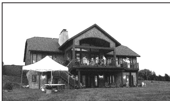
Stars Over Skaneateles Lake Dinner/Dance